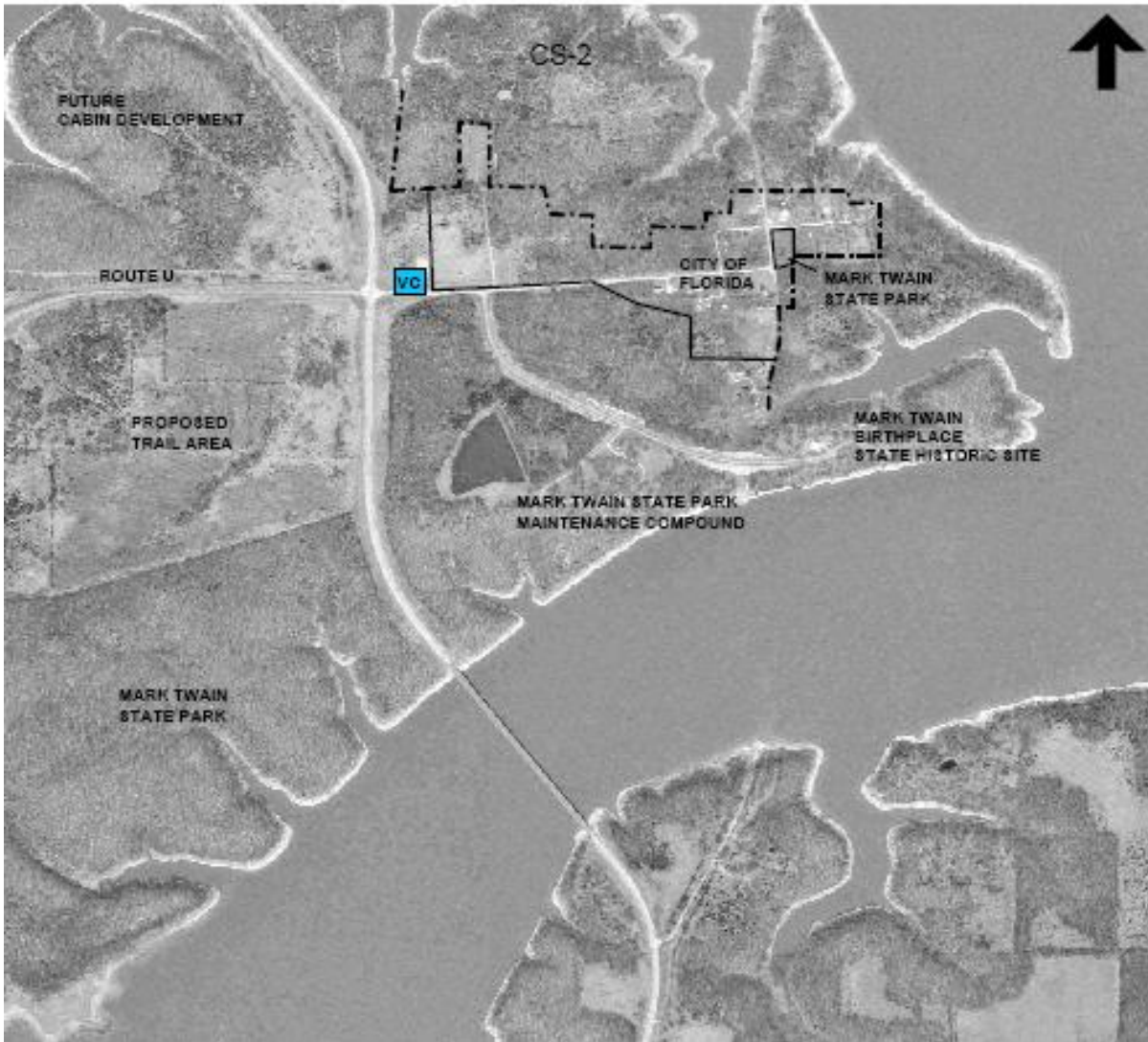
Plate 2 – General Florida, Missouri area showing Pollard Cemetery Cultural Sensitive Area (CS-2).