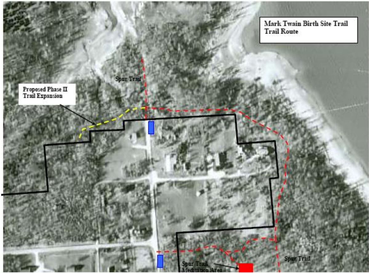
Plate 1 – Trail route showing trailheads (blue) and Meditation Area (red)