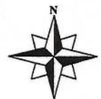
Figure 1 USGS Map