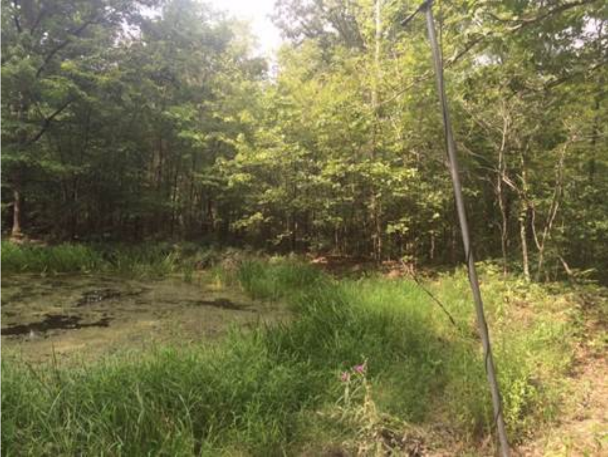
Photo of the pond looking west.