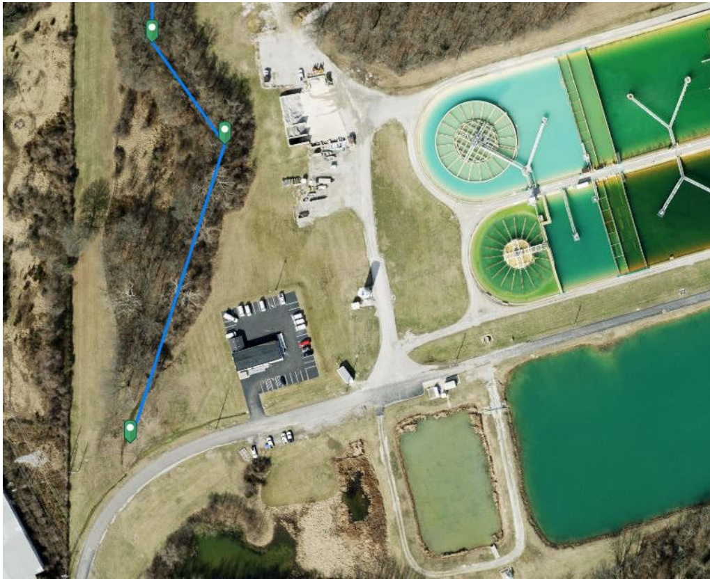
Figure 1 – Project Site

SUBJECT: Pre-2015 Regulatory Regime Approved Jurisdictional Determination in Light of Sackett v. EPA , 143 S. Ct. 1322 (2023), MVS-2024-399