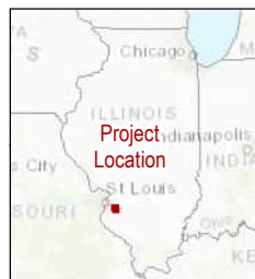
Figure 3 Field Delineated Features Belle Valley Solar Project St. Clair County, Illinois