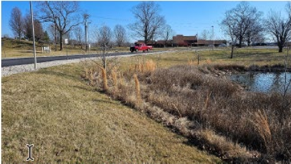
Figure 1: Site Conditions at Wetlands Area, Looking East

SUBJECT: Pre-2015 Regulatory Regime Approved Jurisdictional Determination in Light of Sackett v. EPA , 143 S. Ct. 1322 (2023), MVS-2024-371