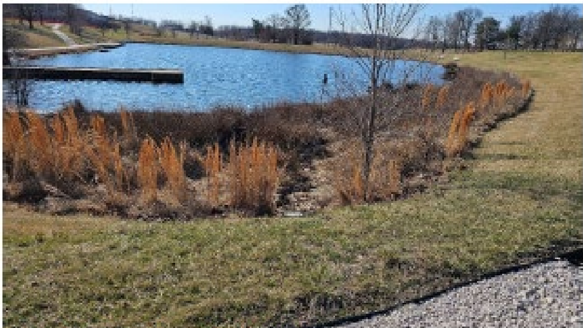
Figure 2: Site Conditions at Wetlands Area, Looking South