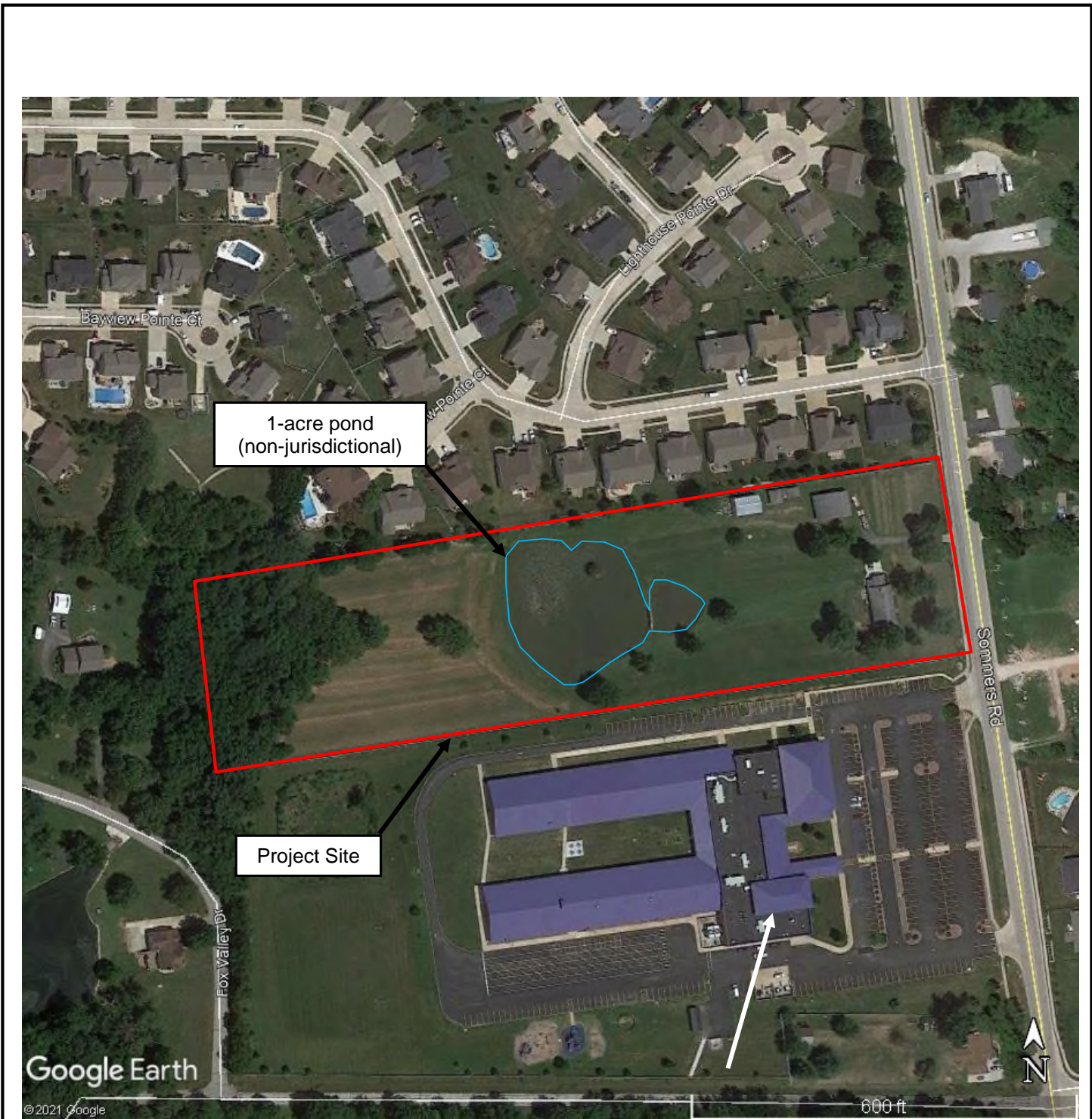
Figure 5 Aquatic Features Delineation Map

6.57-Acre Site 2501 Sommers Road O'Fallon, Missouri