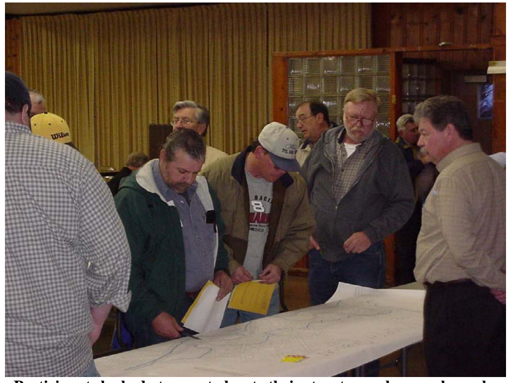
Participants looked at maps to locate their structures along each creek.