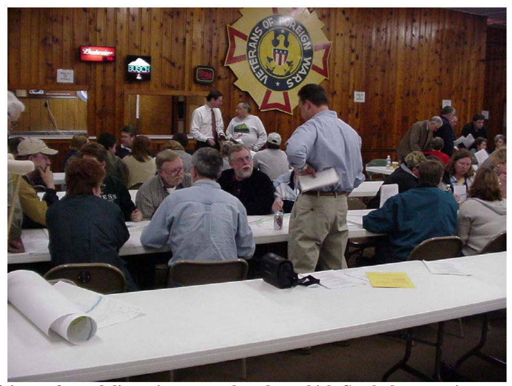
Participants formed discussion groups based on which Creek they were interested in.