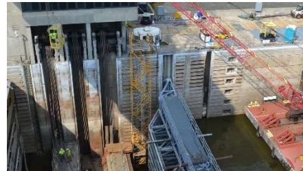
Mel Price Lock liftgate replacement, supply & phase I construction contracts awarded in FY21; Final Phase award TBD