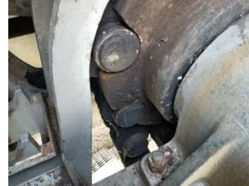
Lock 24 Dam Pier Rehab to include replacement of failing Gate Hoist Chains, Rehab of Bridge, and Repairs to Gates; $40M critical backlog, unfunded in FY22.