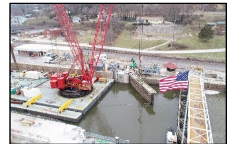
Locks 24/25 gate anchorage replacement, identified as very high risk to waterway and economy, complete winter FY21.