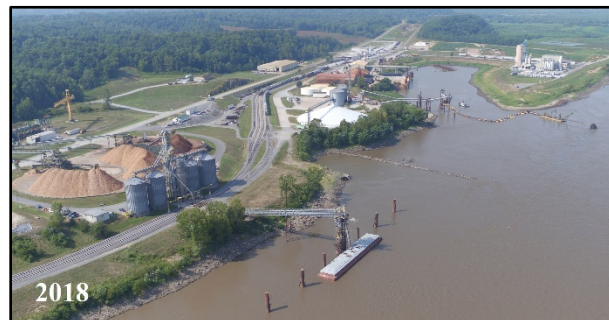
2018 Aerial Photo showing Port Development