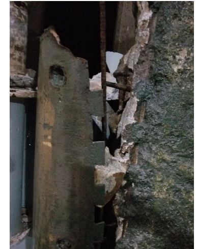
Locks 27 damaged embedded metals, high risk regionally identified backlog maintenance, unfunded in FY21.