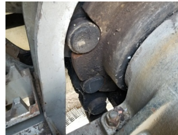
Lock 24 Dam Pier Rehab to include replacement of failing Gate Hoist Chains, Rehab of Bridge, and Repairs to Gates; $40M critical backlog scheduled for award in FY20.