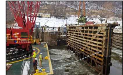
Locks 24/25 gate anchorage replacement, critical fatigue failure mode, identified as very high risk to waterway and economy.