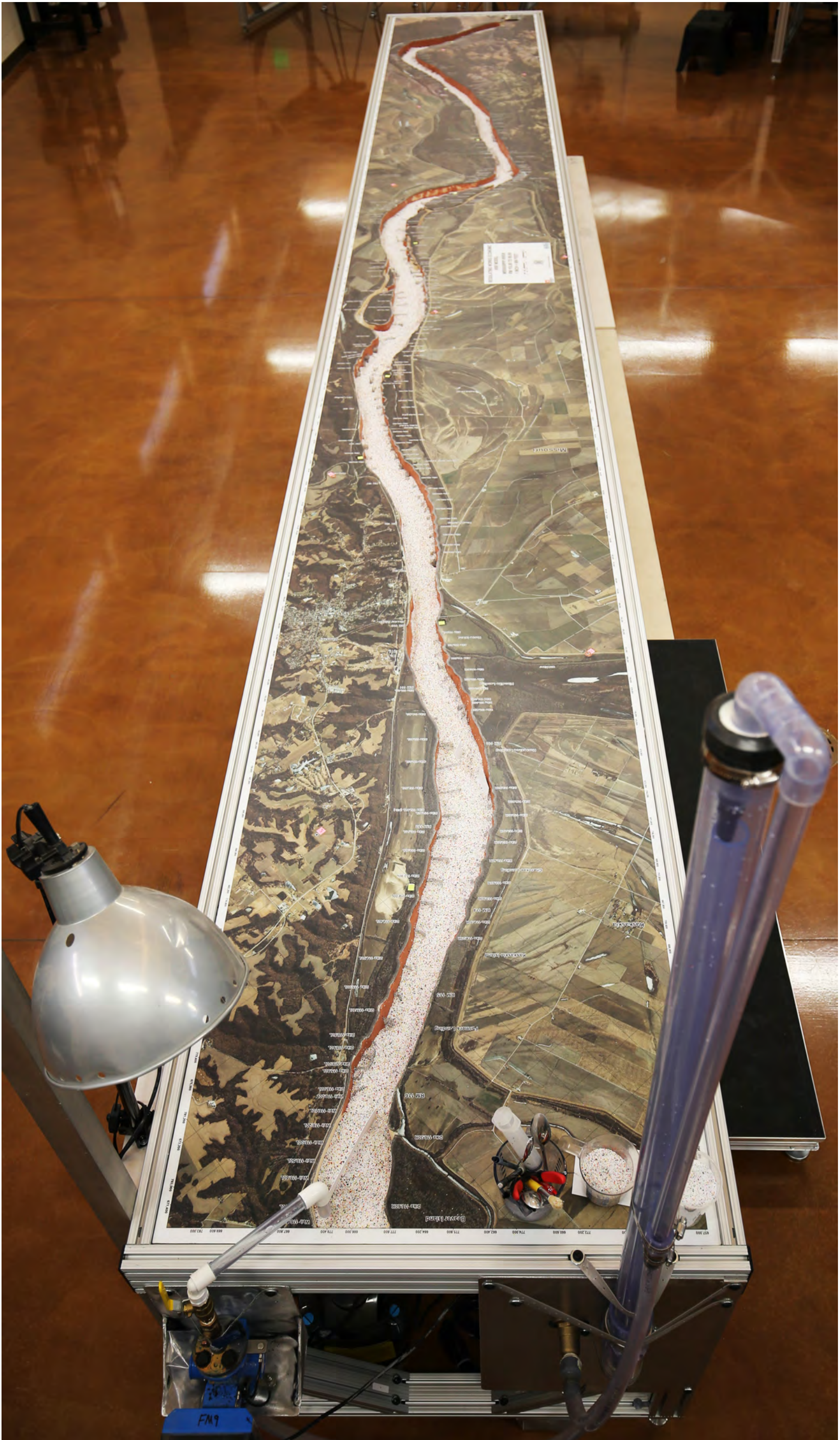
PLATE NUMBER 16