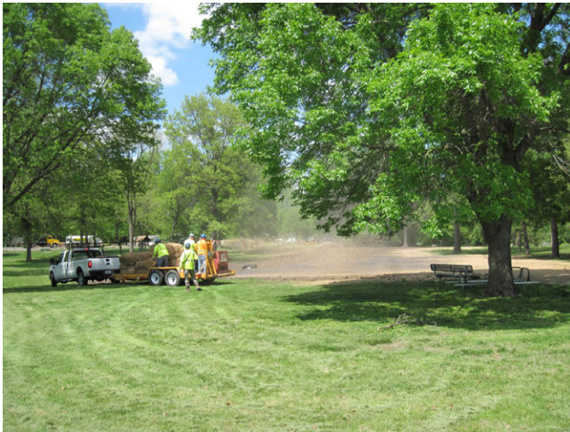
Restoration at St. Cin Park (including turf establishment, as shown) is in progress this summer.

Remedial activities at Duchesne Park in the City of Florissant started in March 2016. To date, USACE has removed over 1,500 cubic yards of contaminated material. USACE tentatively expects to complete Duchesne Park in August 2016.