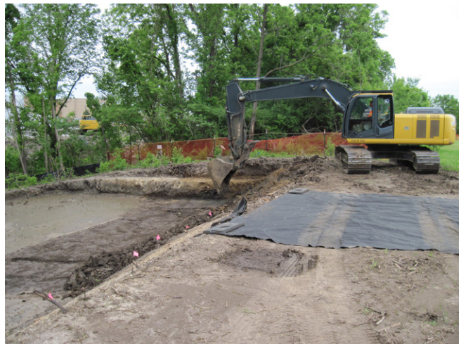
To date, USACE removed over 1,500 cubic yard of contaminated material from Duchesne Park.

Currently, the MARSSIM-based approach is being used to perform sampling and other fieldwork. It is also being used during the strategic planning for the next phases of evaluation.