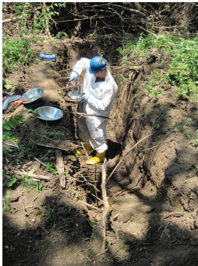
IA-10 Delineation Sampling

this reach of CWC is completed, the USACE will continue characterizing the creek from St. Denis Bridge toward the Missouri River.