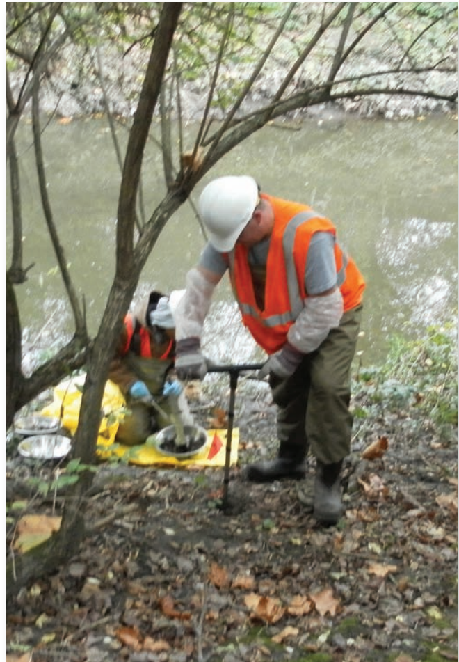
Coldwater Creek - Sampling Depositional Areas

If you have any suggestions, questions, or comments, please contact us.