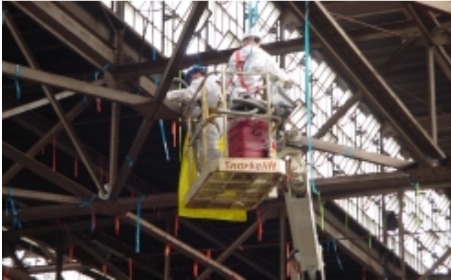
Uranium-contaminated dust at the Madison Site was vacuumed and scraped from overhead structures.