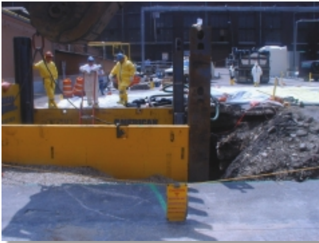
A slide-rail shoring system (shown above) prevents the walls of the excavation from caving in during the Plant 1 remediation.