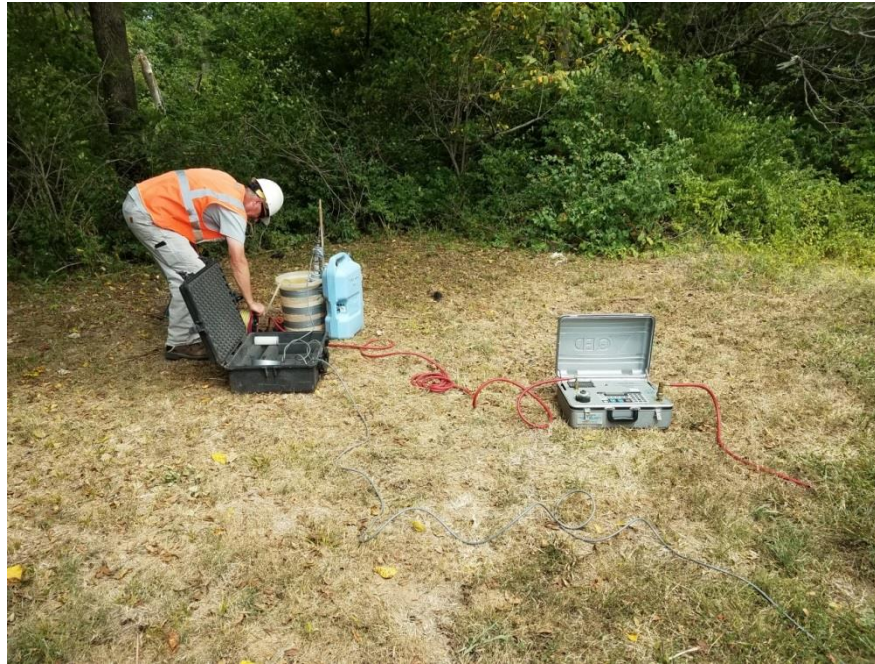
Site Wide Groundwater Monitoring Split Sampling