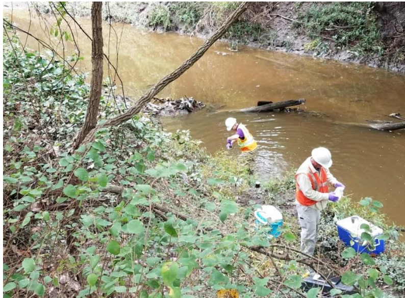
Coldwater Creek Surface Water and Sediment Split Sampling