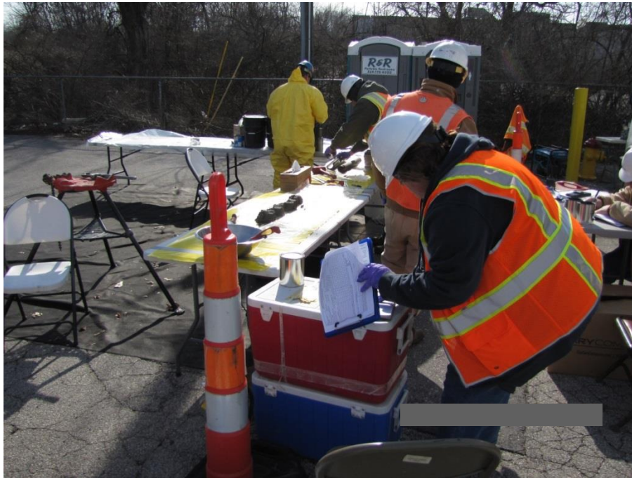
Soil split sampling with Corps contractors Florissant Gardens Shopping Center