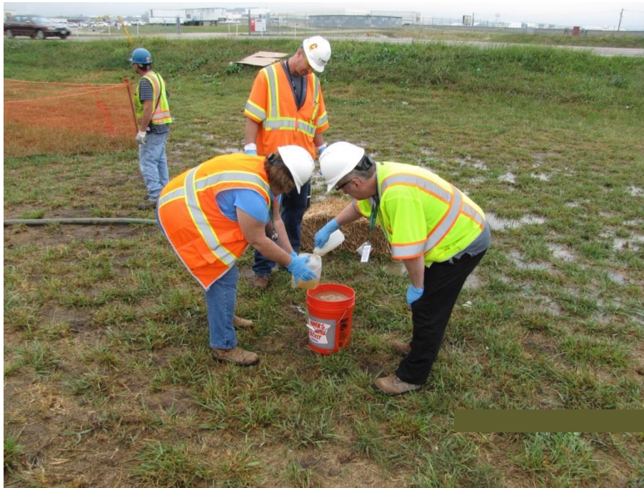
Collection of surface water split sample Ball Fields Area