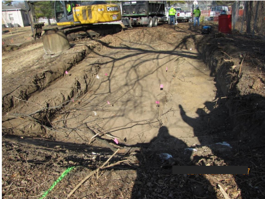
Inspection of ongoing excavation and sampling activities at the Chez Paree Remediation Area