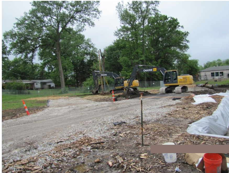
Inspection of Site Progress Palm Drive Remediation Area