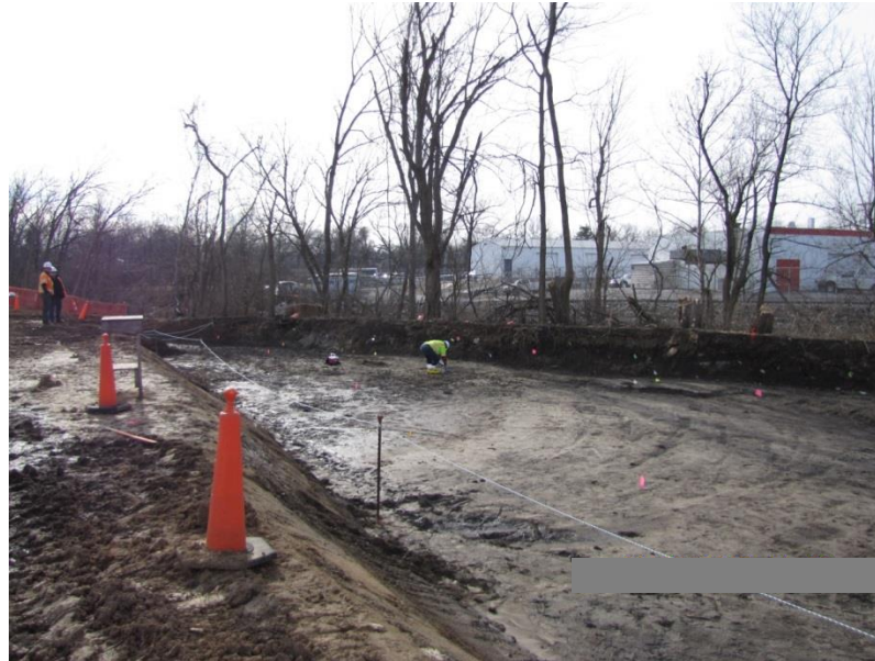
MoDNR composite sampling of a completed survey unit at Duchesne Park