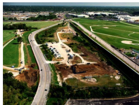
SLAPS required remediating 10 contaminated sites.