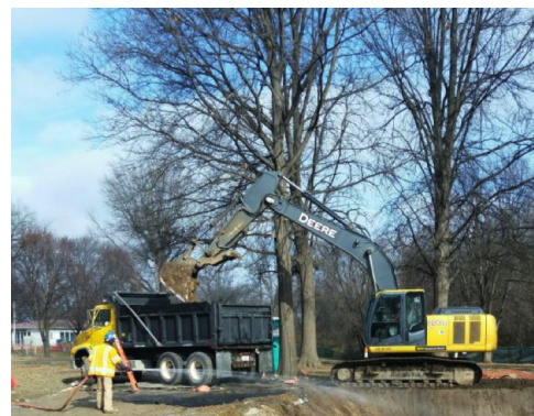
Remedial activities at Duchesne Park are now complete.

Generally speaking, at St. Louis FUSRAP sites, the contamination is several inches to several feet below ground level, capped with vegetation, asphalt, or concrete and/or is in areas that are restricted from the general public.