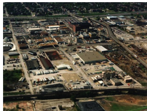
SLDS required remediating 37 contaminated sites.