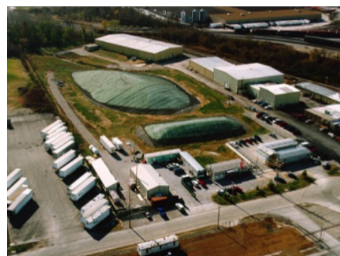
Remedial action under the North County ROD was completed at HISS and Futura in 2013.