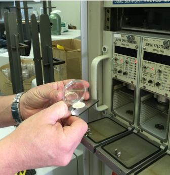
Alpha spectroscopy is used to analyze each sample’s individual radiological isotope.

USACE established the onsite laboratory to test samples for uranium, thorium, and radium from CWC monitoring, other SLAPS Vicinity Properties, and St. Louis Downtown Sites remediation efforts. The transfer of samples from sampling teams to the FUSRAP Laboratory is tracked by a Chain-of-Custody form that accompanies the samples while they await analysis and provides sample information to the lab staff. The Chain-of-Custody documentation is required to support sample validity. It verifies that the samples are not tampered with before being received by the lab. The “holding time” from sample collection until the start of sample preparation is regulated to ensure sample stability.