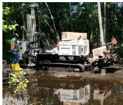
Drill rigs drill for soil samples quickly but getting them in place is not always easy because dense brush and woods and other obstructions limit access to many sampling locations.

Seven FUSRAP team members support and perform radiological scans of consolidated materials and surface soil using portable radiological instruments. They move radiation detectors at a constant distance from the surface being investigated. For surface soil, gamma walkover radiological scan surveys can be particularly difficult because of brush, steep banks, and rough terrain, again increasing the time required. Daily surveys are processed and reviewed by FUSRAP's geographic information system (GIS) team and by a health physicist to determine if additional investigation is needed.