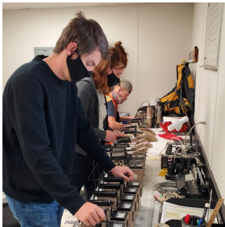
The FUSRAP radiological survey team checks their instruments' calibrations daily. This step is necessary for data accuracy.

Every morning, the field team meets to discuss safety, lessons learned, and plans for the day. They communicate with property owners and then look over the sampling site for potential hazards (poison ivy, fall and trip hazards, wild and domestic animals).