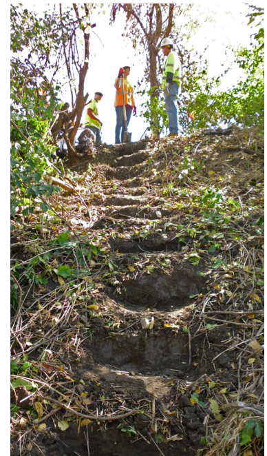
Project scope, scheduling, bad weather, or difficult access can lengthen the CWC sampling timeline. Additional actions may also be required. For example, a crew may need additional time to clear away heavy brush or cut steps into a steep embankment.

After contacting Missouri One Call to locate underground utilities, teams use Global Positioning System (GPS) to locate, flag, and collect photos of sampling locations indicated in the WP. They record the location coordinates and elevations before the sampling crews arrive.