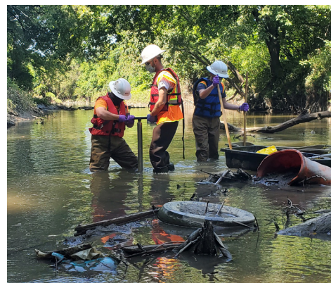
Debris and site conditions make sample collection challenging.