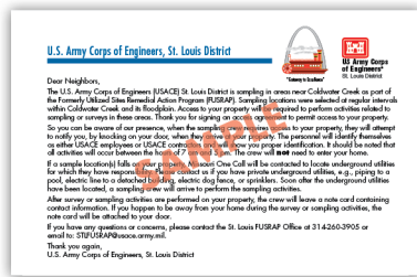
Postcard Sent to Residents