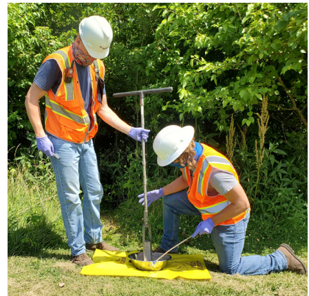
The FUSRAP team will collect soil samples from the surface to 6 feet or deeper. They collect samples manually most of the time but sometimes must use a drill rig for deeper samples.

If you have special considerations before signing an ROE, such as dogs, health issues, etc., contact the FUSRAP realty specialist at 314-331-8167 to discuss those concerns.