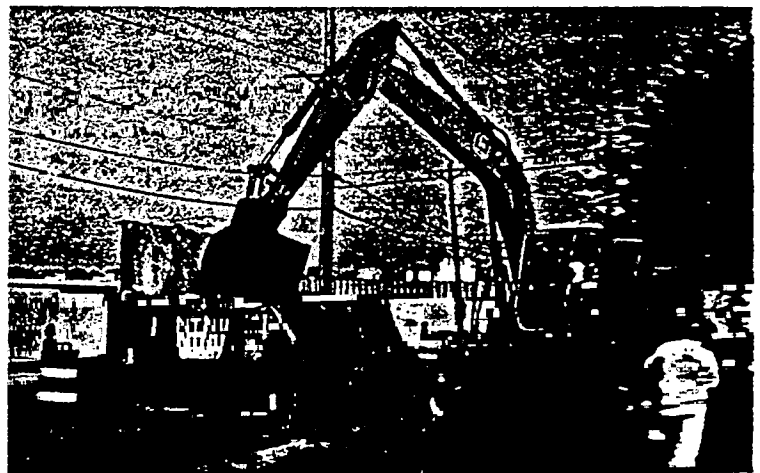
First buckets of contaminated soil are placed in an intermodal container.

All affected property owners recently signed agreements allowing the work to proceed and are pleased that the cleanup is underway.