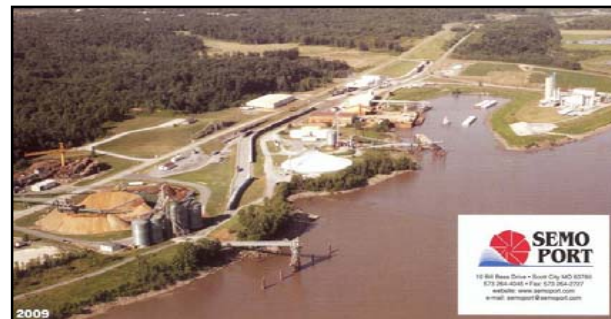
2009 Aerial Photo showing Port Development