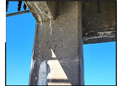
Lock 24 Dam Pier Bridge Columns, failed condition due to ASR concrete