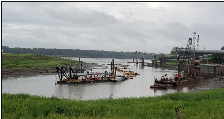
SEMO Port was last dredged in September 2021.