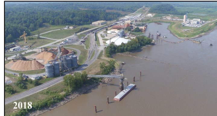
2018 aerial photograph showing Port