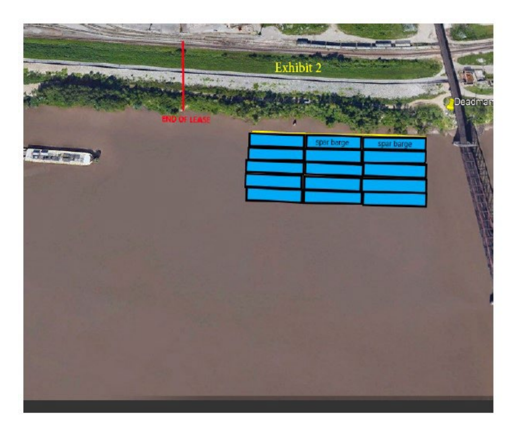
Attachment 3 – Merchant's Fleet Lower and Deadman Location

Lower end of Proposed Area - Merchant's Fleet Lower