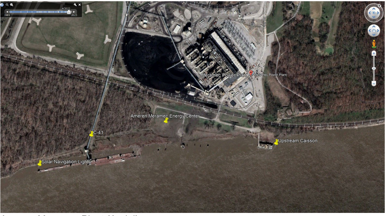
Ameren Meramec Plant (Aerial)