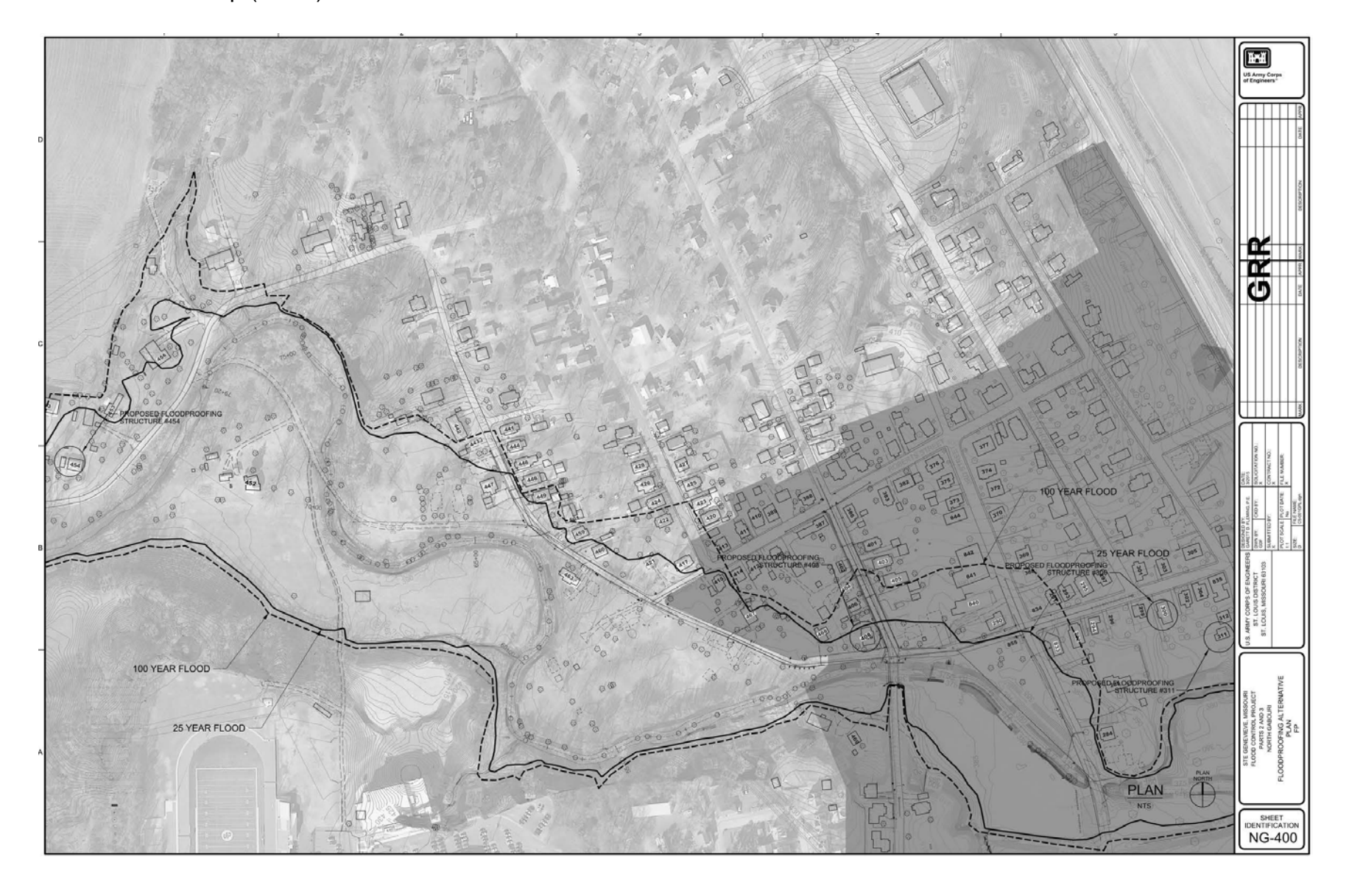
Exhibit B: Map (2 of 3)