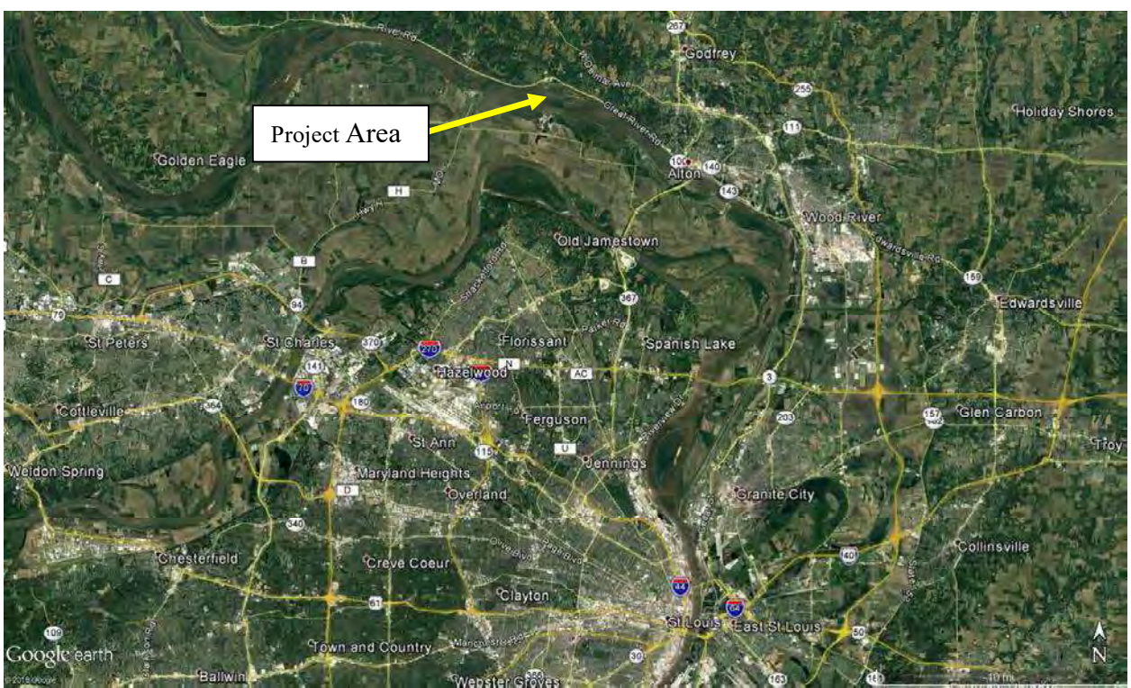
Figure 1 Locator map for Piasa & Eagles Nest Islands