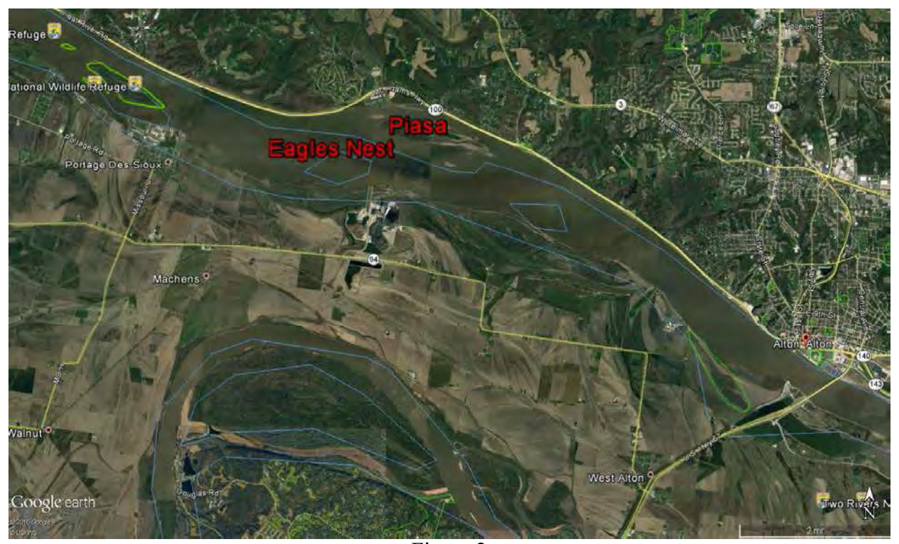
Figure 2 Piasa and Eagles Nest Islands vicinity map

This project will consist of dredging channels in the interior backwater of Piasa Island, dredge material would be placed behind constructed chevrons increasing the likelihood of island or sandbar formation, dike notching, three chevrons and two trail dikes are proposed to be built at the tail end of Eagles Nest Island, and erosion protection structures at the head of Piasa and Eagles Nest Islands. The following reference provides additional details of the project Piasa and Eagles Nest Islands Habitat Rehabilitation and Enhancement Project . See figure 3 for locations of structures.