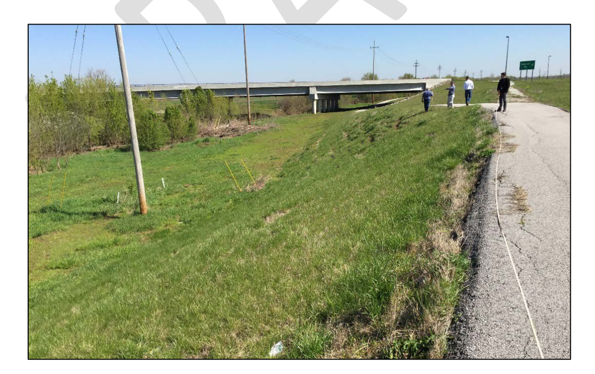
Figure 4. Photo of Slide 2.