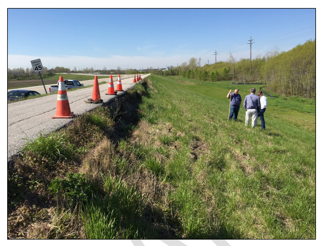
Figure 3. Photo of Slide 1.