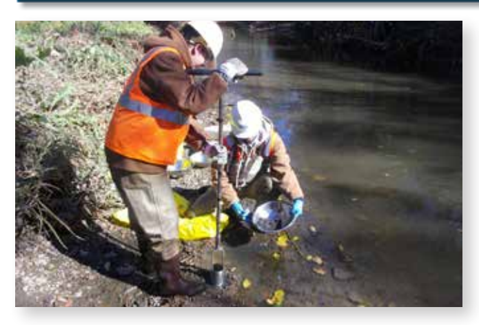
Coldwater Creek Sampling