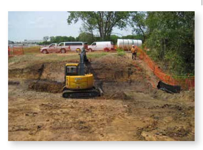
Ballfields Phase 2 Excavation

RA is required in the interior of buildings located at VP-01L. A design is currently underway at VP-01L, and remediation is expected to begin in early 2013. An addendum to the VP-01L/10K530087 PRAR/FSSE will be published upon completion of remediation within the buildings.